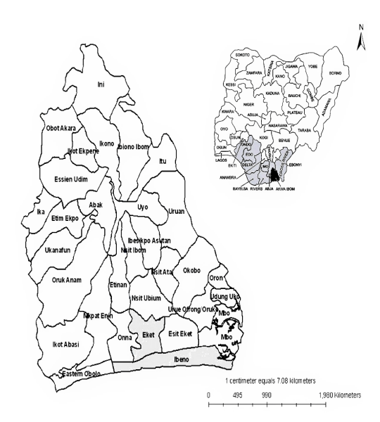
Figure 1: Show Specific Study Site and Akwa Ibom State, Nigeria

Assessment of Trace Metal Concentration in Natural Surface Water Consumed in Uyo Village Road Akwa Ibom State. Nigeria